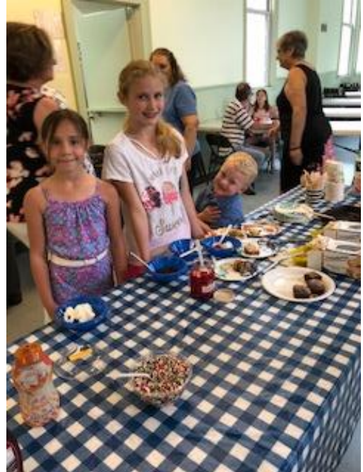
Ice Cream Social enjoyed by the young folk!