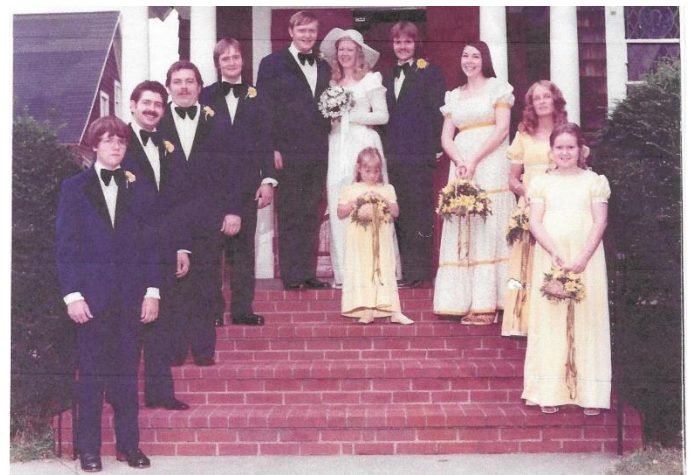
They were married at St. Paul's 45 years ago on September 16