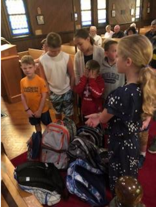
Blessing of the backpacks