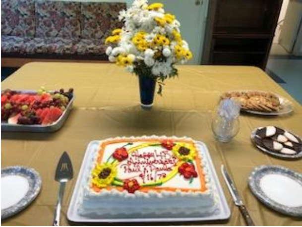
And we celebrated their anniversary with a cake for coffee hour