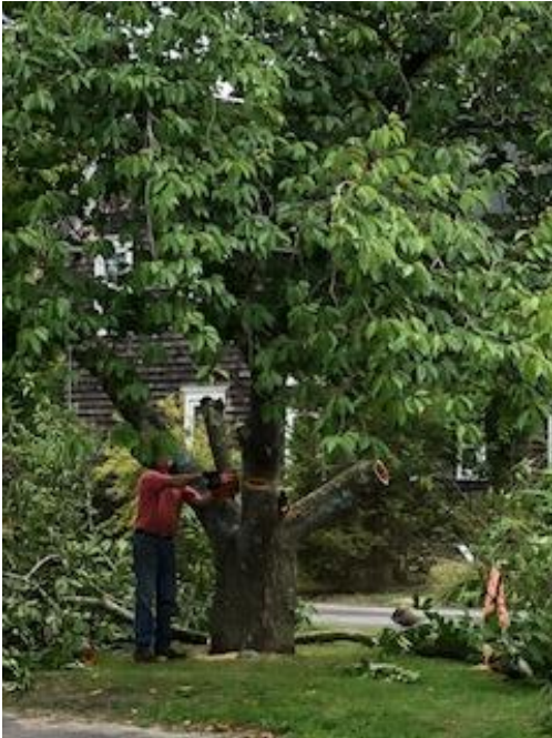
Goodbye cherry tree